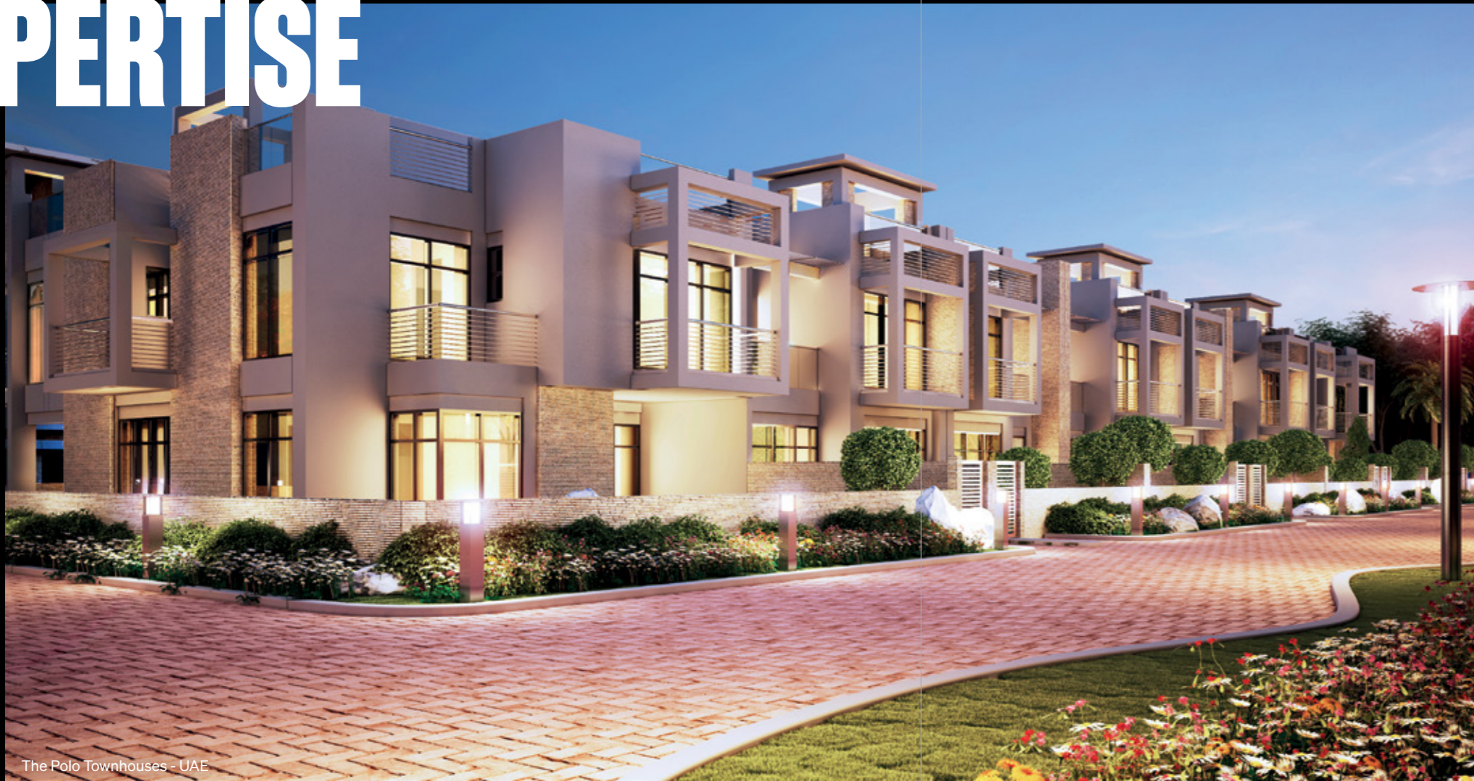
The Polo Townhouses - UAE