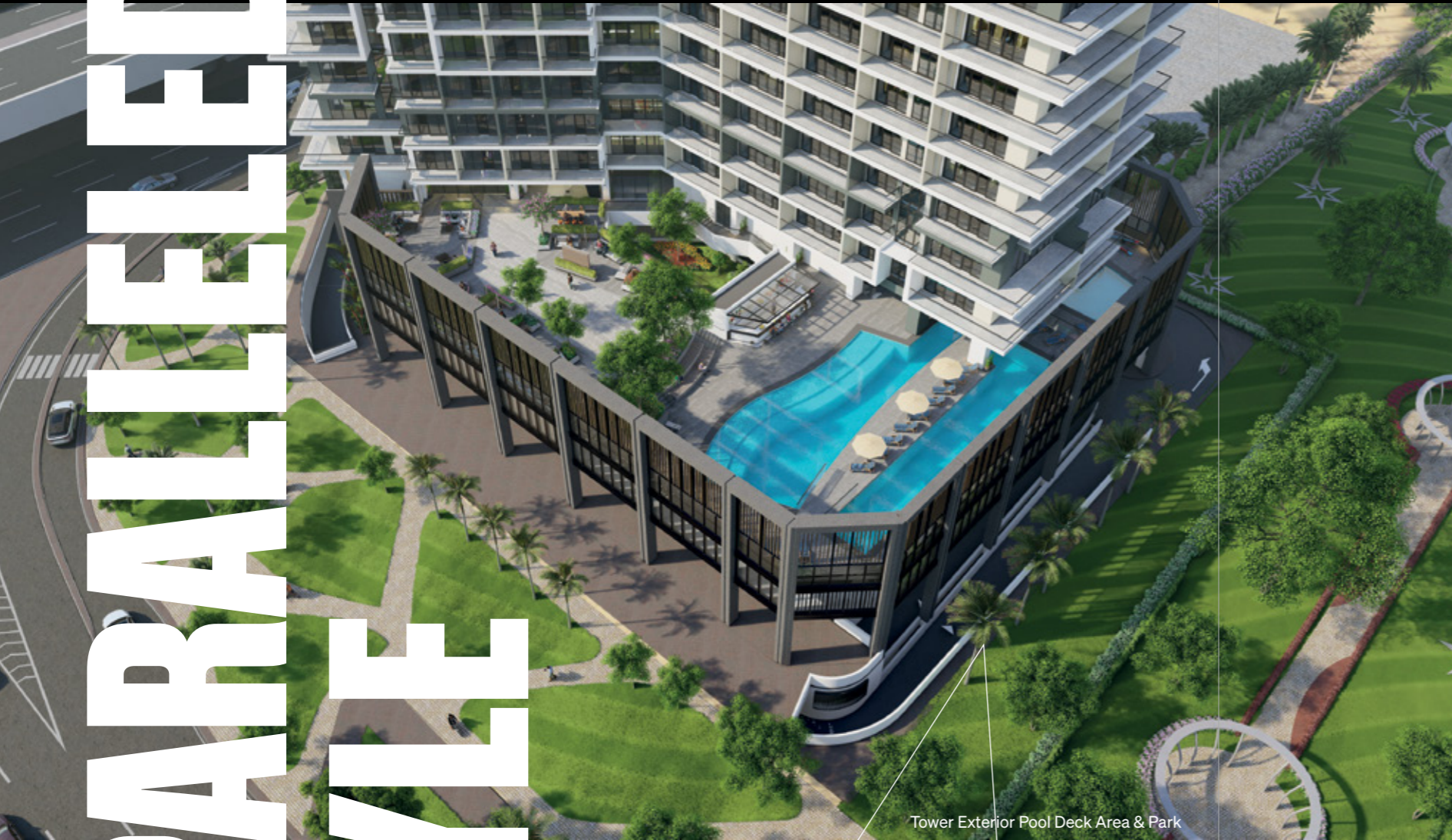
Tower Exterior Pool Deck Area & Park