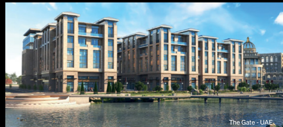
The Gate - UAE

Today, an expanded and impressive portfolio of premium properties, which includes some of the most sought-after properties by meticulous clients worldwide, serve as a testament to IGO's well-deserved reputation as one of the top regional investment companies.